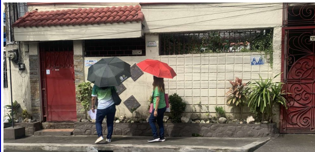
LFS CamSur Personnel locating sample HHs during the enumeration held on January 8-30, 2025.

The Provincial Office of Camarines Sur successfully conducted the January Labor Force Survey (LFS), achieving a 99.7% response rate from 386 sample households across the