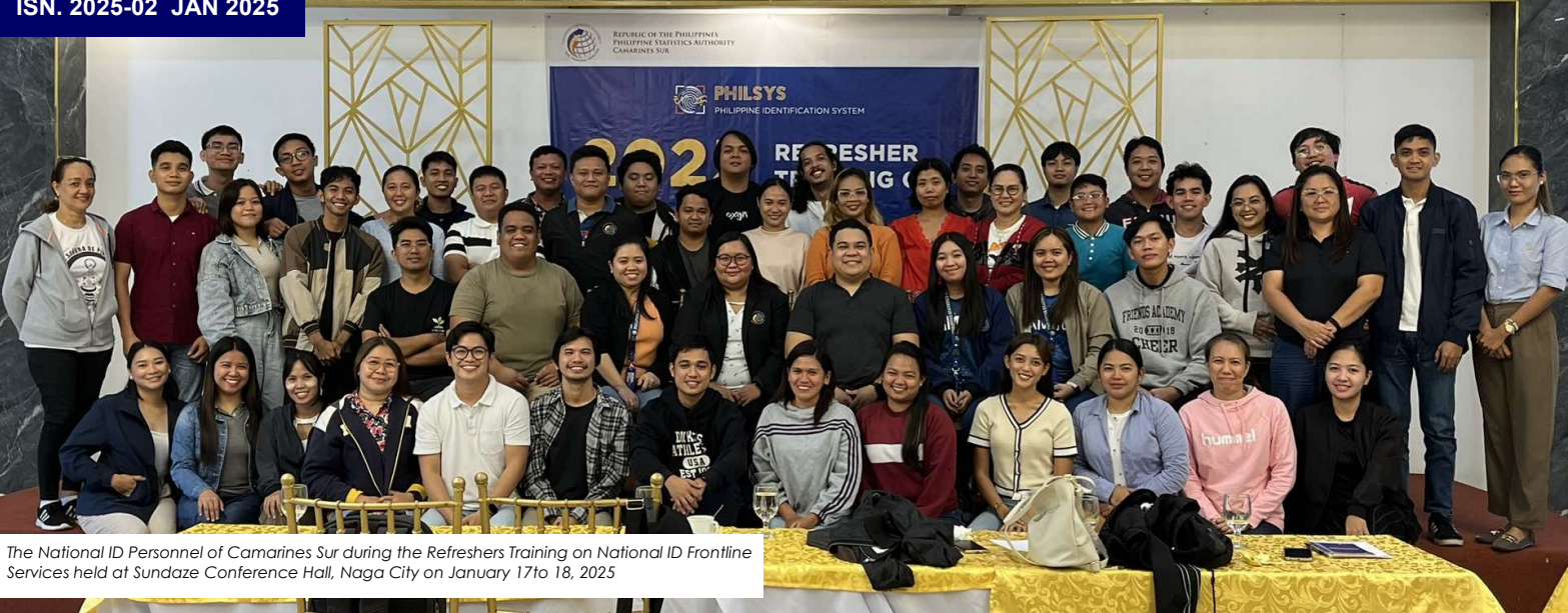
The National ID Personnel of Camarines Sur during the Refreshers Training on National ID Frontline Services held at Sundaze Conference Hall, Naga City on January 17 to 18, 2025