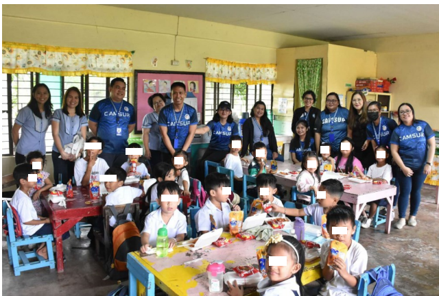
Pupils of Dahilig Elementary School with PSA Camarines Sur personnel during the Gift Giving and Feeding Program held on January 25, 2025

In line with its commitment to social responsibility, the Philippine Statistics Authority (PSA) Camarines Sur organized a Gift Giving Activity and Feeding Program on January 23, 2025, benefiting 13 elementary students from Dahilig Elementary School in Gainza, Camarines Sur.