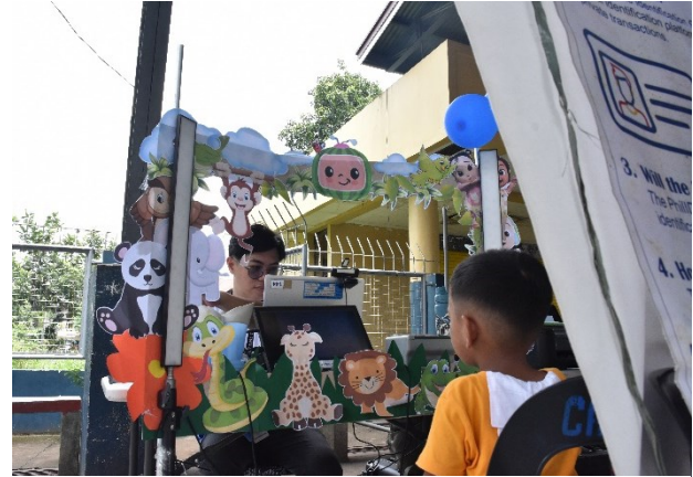
PhilSys RKO conducting Step 2 Registration

The Philippine Statistics Authority (PSA) Camarines Sur Provincial Office successfully launched the “Rehistro Bulilit” Campaign at Don Manuel Abella Plaza, Brgy. Cararayan, Naga City on 31 August 2024.