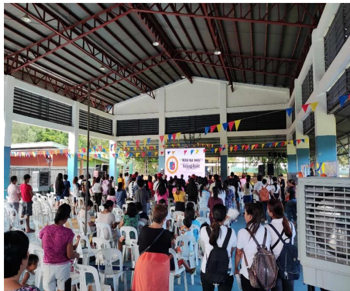
ePhilID and PhilSys Check Activation, 11 Nov 2023 at Brgy 56 Taysan, Legazpi City