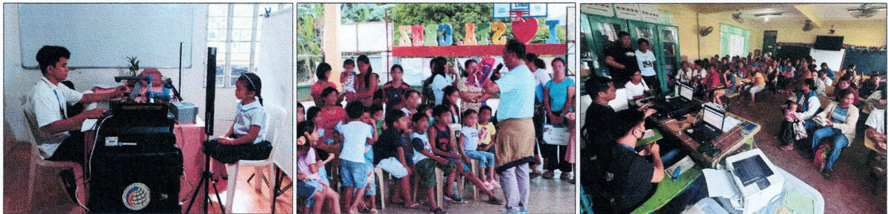
Left to right: National ID school registration at San Luis Elementary School, Daet, Camarines Norte; gift-giving activity for schoolchildren at Sta. Cruz, Libon, Albay; and Mobile CRS Outlet deployment at Bato North Central School, Bato, Camarines Sur — all conducted in 2025

27 June 2025 – In support of the Department of Education’s Oplan Balik Eskwela (OBE) 2025, the Philippine Statistics Authority (PSA) V pledges to deploy Mobile Civil Registration System (CRS) Outlets and National ID Registration Services to requesting schools across the Bicol Region for the opening of School Year 2025–2026.