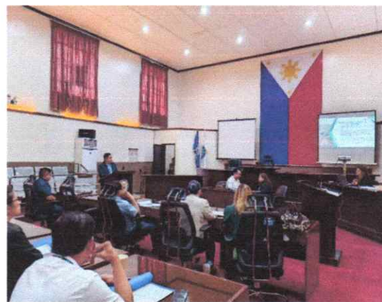
During the Discussion