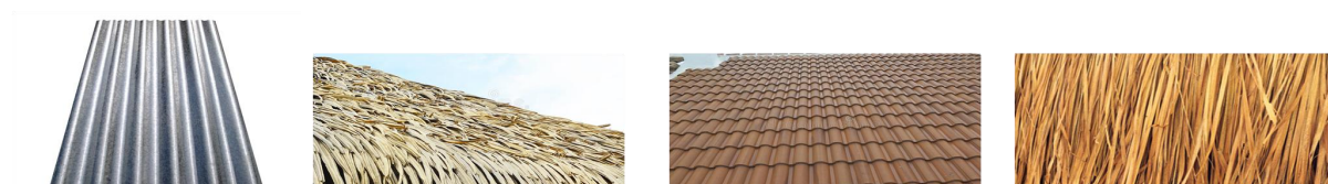
Table 3. Number of Occupied Housing Units by Construction Materials of the Roof, La Purisima (Pob.), Goa: 2015

Most of the occupied housing units had roofs made of galvanized iron/aluminum in 2015. In Brgy. La Purisima (Pob.), 77.63% of the occupied housing units in 2015 had roofs made of galvanized iron/aluminum. Meanwhile, the proportion of occupied housing units with roofs made of bamboo/cogon/ nipa/anahaw, was posted at 13.16% while the proportion of housing units with roofs made of half galvanized iron and half concrete was registered at 6.58% in 2015.