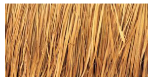
Table 3. Number of Occupied Housing Units by Construction Materials of the Roof, Divina Pastora (Pob), Bato: 2015